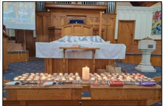
White Ribbon Sunday 16 Nov