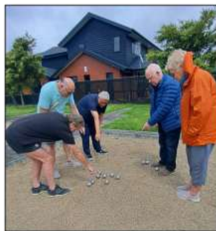
P e t a n q u e