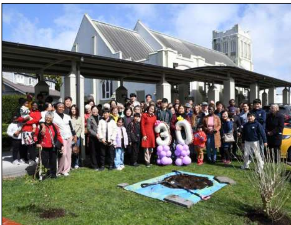
Trees representing Kiwi and Korean together for 30 years