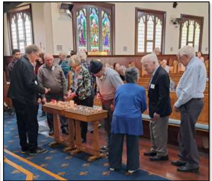
2 November All Souls' Day

https://www.youtube.com/watch?v=bbz2boNSeL0